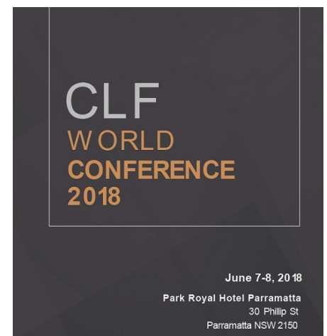
A brochure of the CLF Conference organized by Park Ock-soo's Salvation Sect in Australia

By making an infant care community, Park's Salvation Sect has also propagated to families with infants. The group created the popular infant care community called "Mamkium" in Seoul's Seocho-gu district. This community has even been selected by the Seocho-gu gender equality business and Yangjae Social Welfare Center in 2016. Their activities have been introduced on EBS and KBS1 radio, and the group has been selected by the Seocho-gu Naegok-dong community initiative. Having offices in Seoul, Daejeon and Gangneung, the group also keeps close contact with local politicians. Good News Mission keeps Mamkium as its head while operating Suwon's Mamoni, Daejeon's Mamsoul, Daegu's Mamdream and other communities in other regions. These groups carry out recreational events for moms and kids, and they invite lecturers from the National Training Institute for Mind to incorporate mind education to these programs. Most of these lecturers are affiliates of Good News Mission. They also organize big performances by groups such as the Gracias Choir and publish the magazine "Tomorrow" to be distributed to cafes nation-wide.