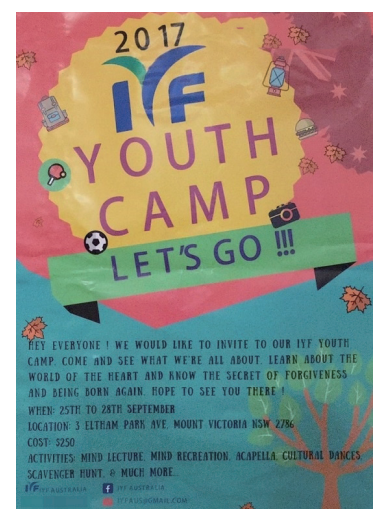
Advertising poster for Australia's IYF World Camp